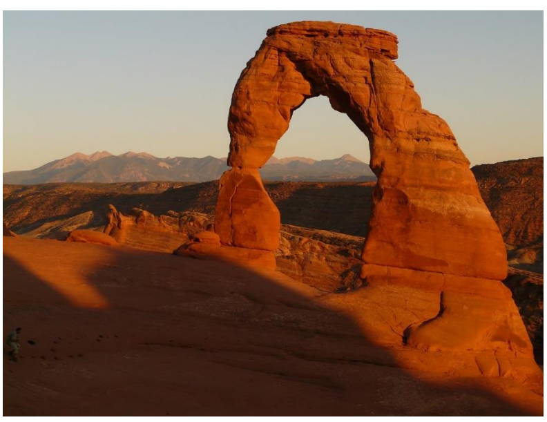
Day 4: May 20, 2025: Arches National Park

After breakfast at the hotel, we enjoy a full day guided sightseeing tour, experiencing the incredible red rock wonders of Utah. We start the day at Arches National Park, marvelling at the gravity-defying arches and other stone formations that have made this park famous. A scenic drive along "The River Road" will take you to Red Cliffs Lodge for a delicious lunch. In the afternoon we explore the Island in the Sky district of Canyonlands National Park before finishing the day at Dead Horse Point for some final stunning vistas. We then return to Moab. (B,L)